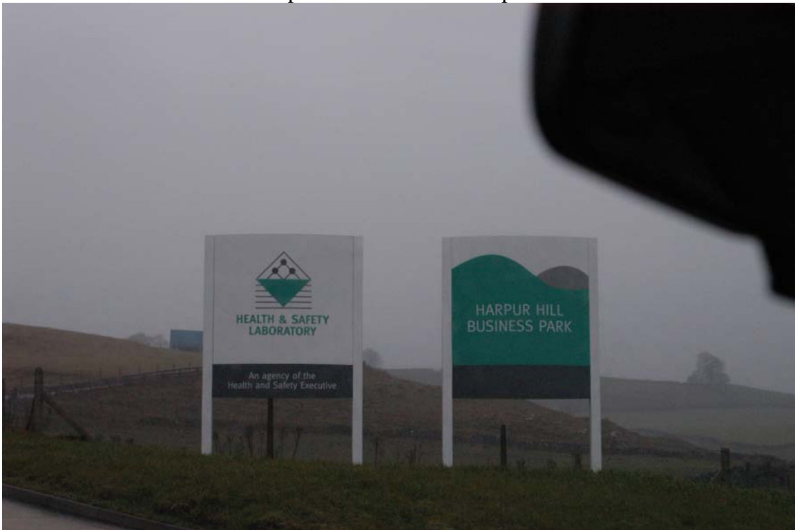
Photo 1 - Entrance Sign

On 21 February, 2006, ISC performed preliminary testing on the Megalodon Closed Circuit Rebreather at the Health & Safety Laboratory in Buxton, UK. The HSL is an agency of the Health and Safety Executive. Purpose of the testing session was to determine performance of the Megalodon based on the CCR rebreather standards, EN14143. Here are some of the pictures taken on this trip.