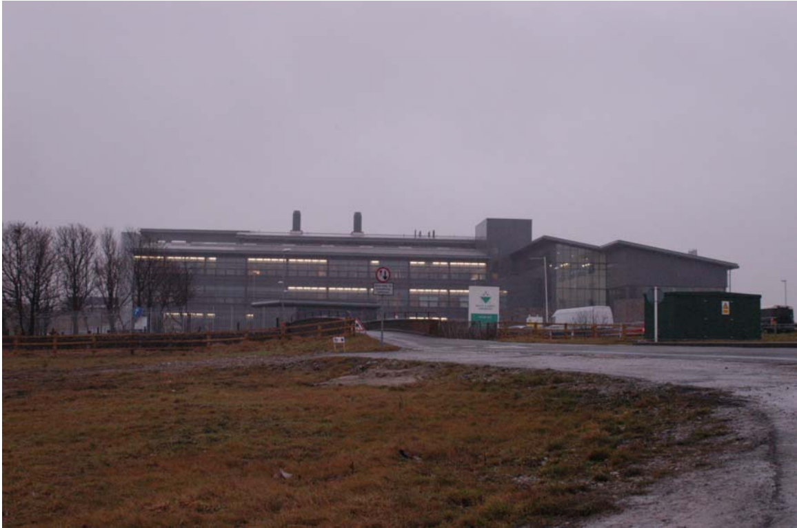
Photo 2 - Facility view