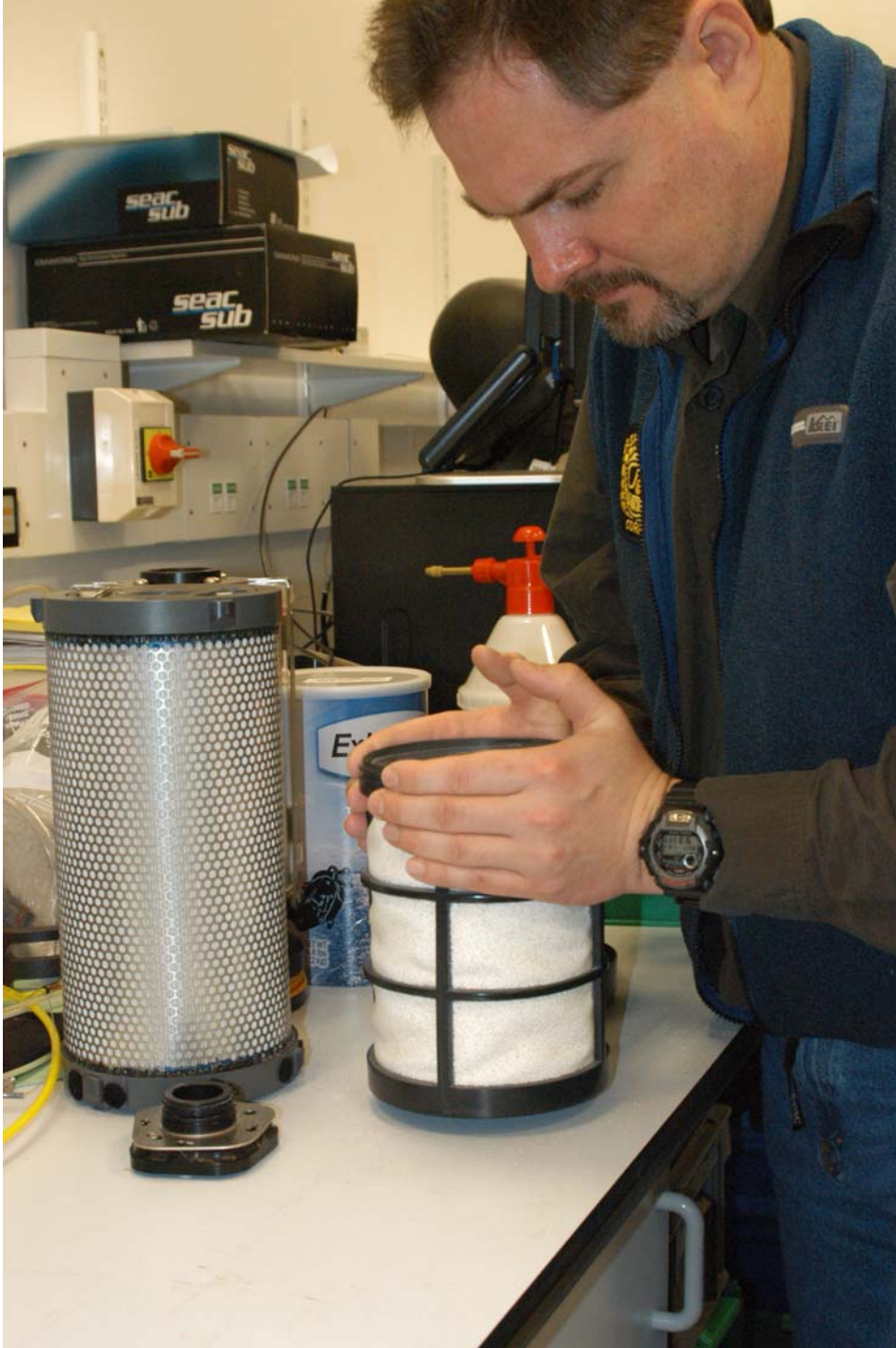
Photo 9 - Packing Prism Radial Scrubber for MEG testing