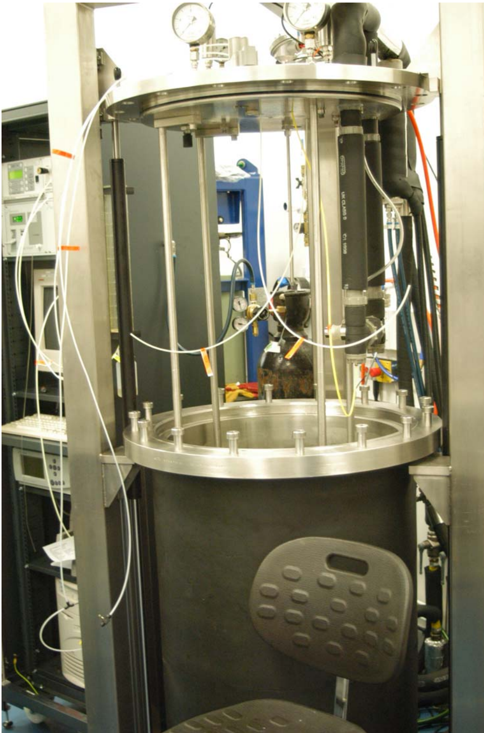
Photo 5 - ANSTI Breathing Machine Rebreather Test Chamber