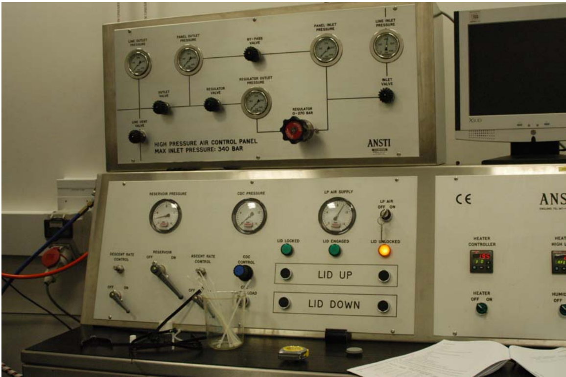
Photo 6 - The ANSTI Control Console