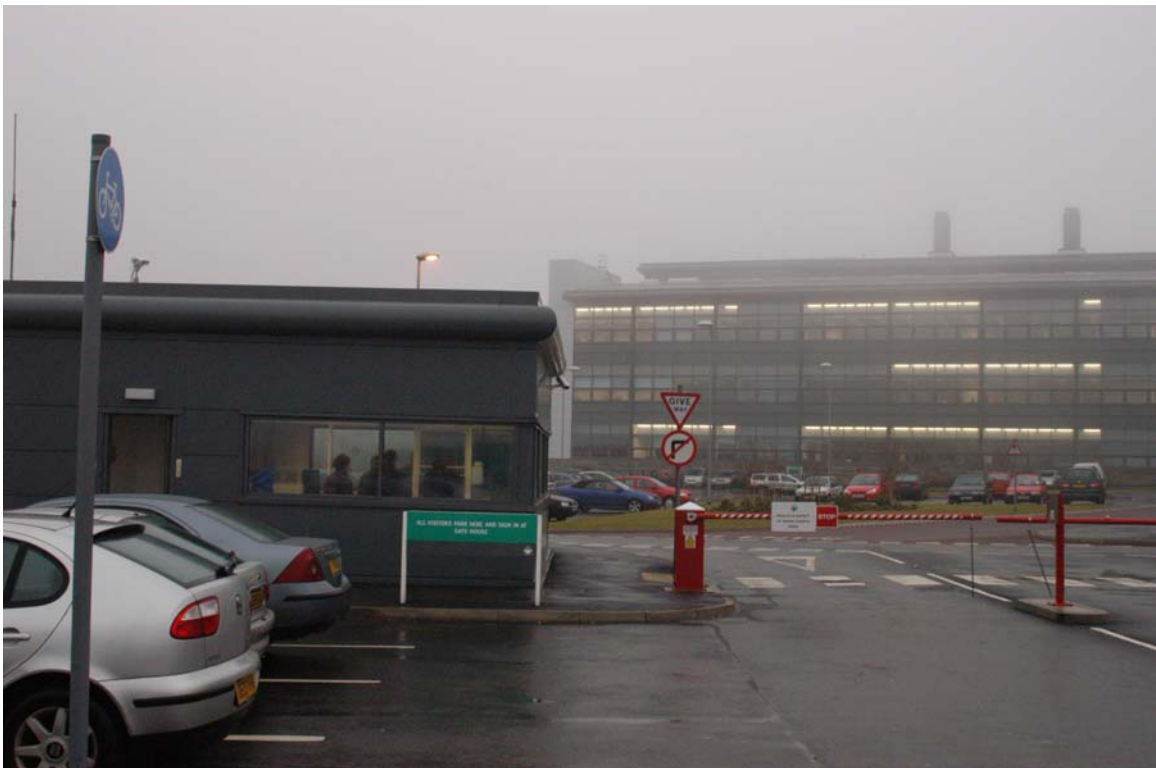
Photo 3 - Main Gate facility view