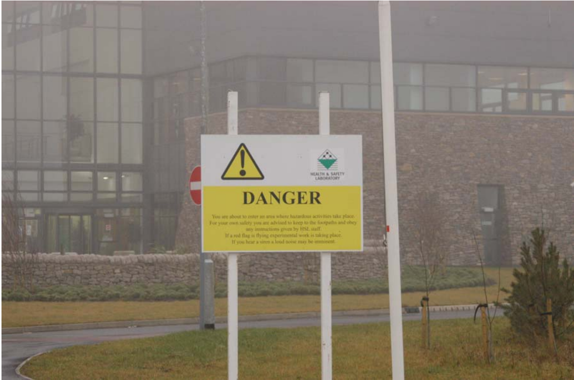
Photo 4 - Appropriate safety warning signs