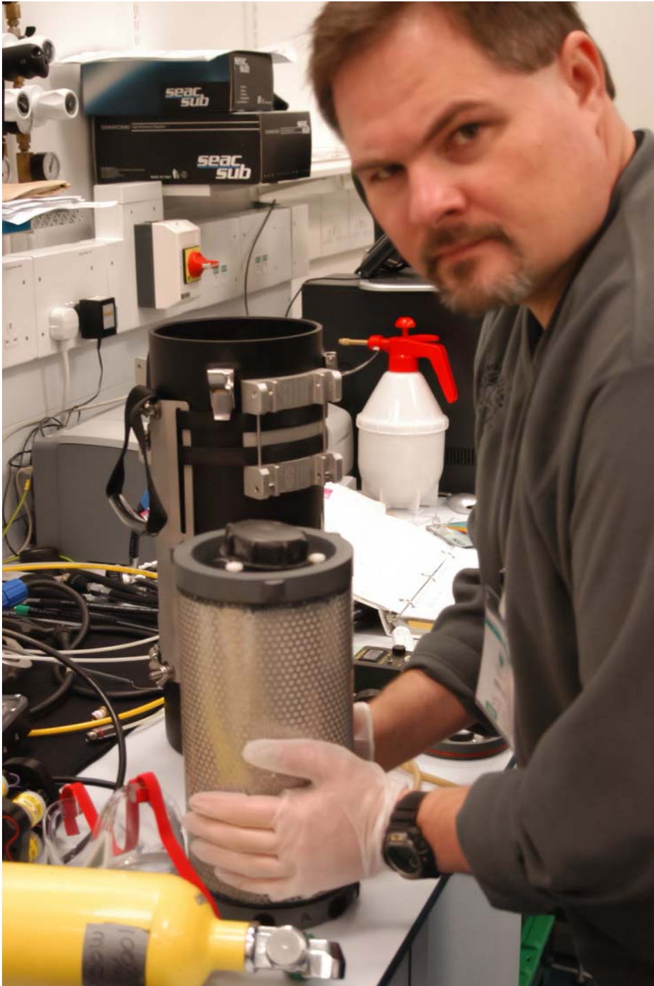
Photo 7 - Cis Lunar Scrubber Packing - Fits MEG