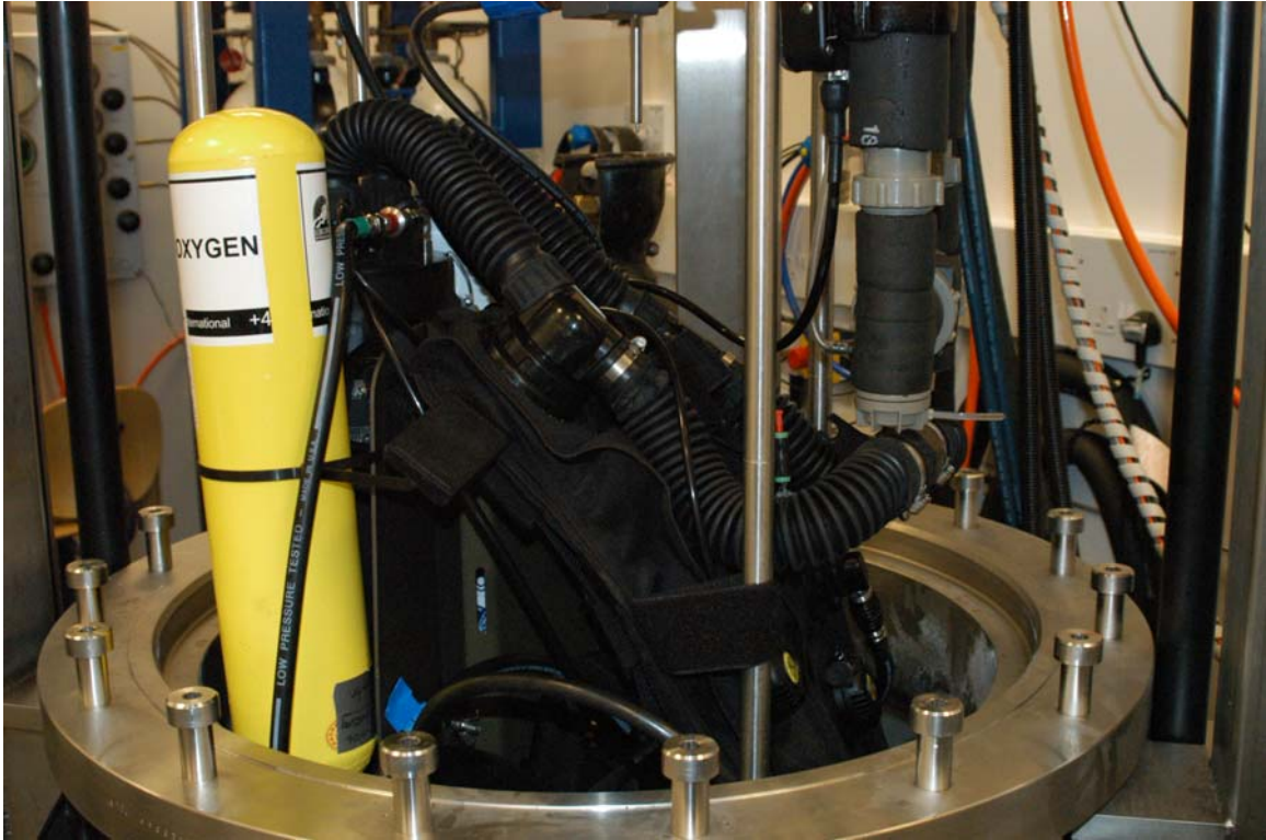
Photo 8 - MEG setup in test chamber